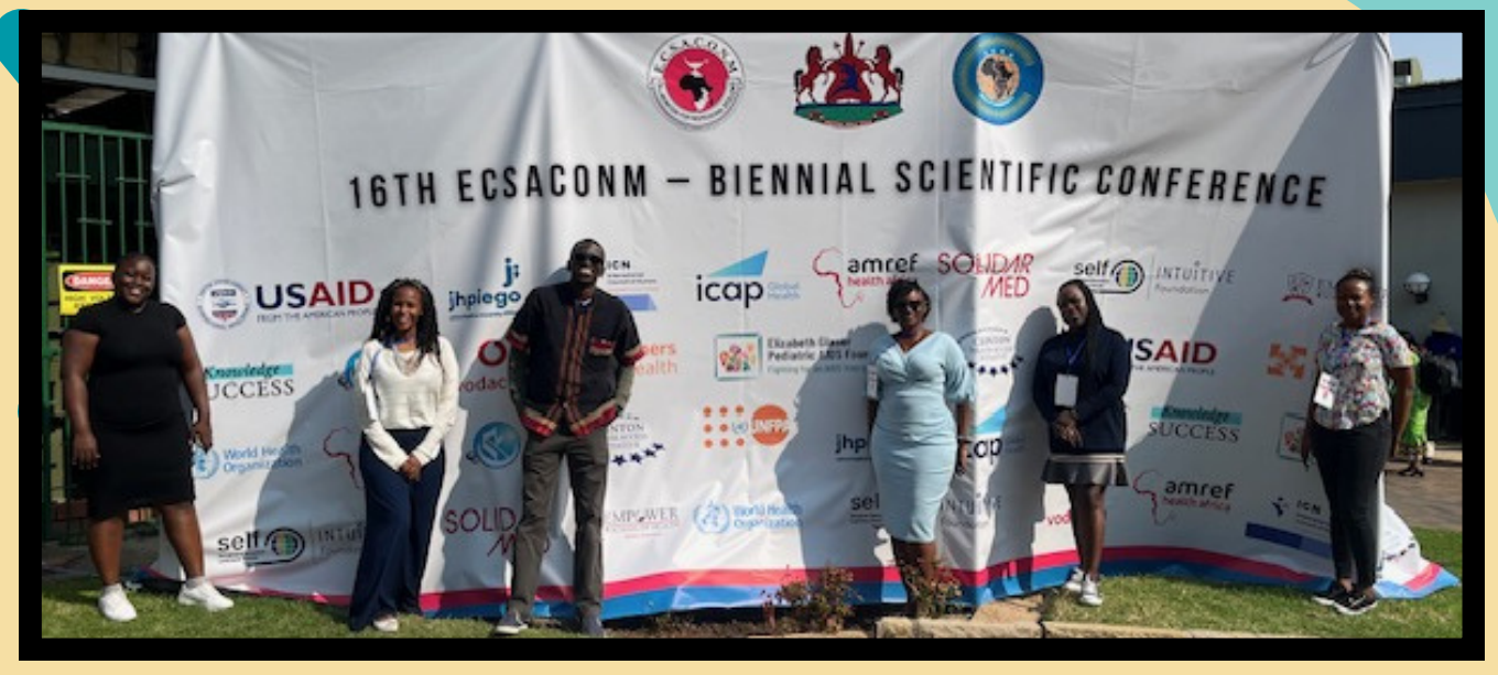
Knowledge SUCCESS Team at ECSACONM's 16th Biennial Scientific Conference in Maseru, Lesotho.