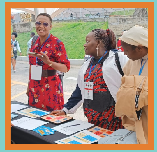
Conference participants visit the Knowledge SUCCESS Exhibition Booth.