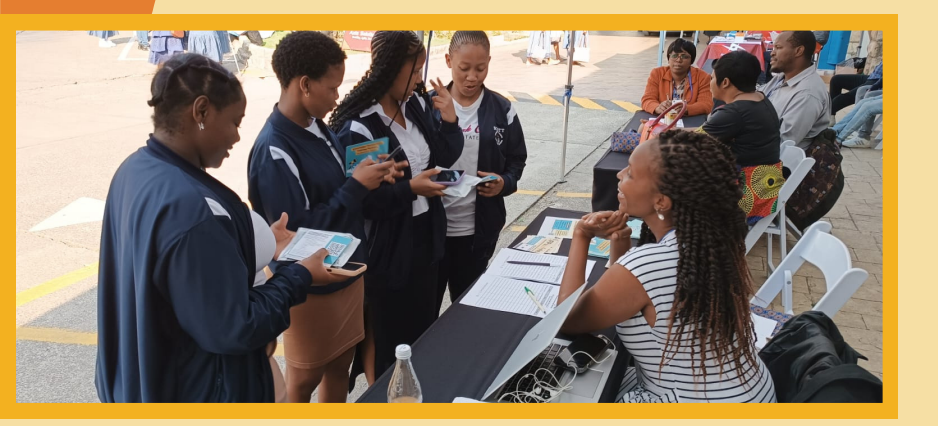
Lesotho university students engage with project staff at the Knowledge SUCCESS exhibition booth.

Additionally, the project exhibition booth showcased and organized Knowledge SUCCESS resource and promotional materials for further engagement and visibility for KM and project activities.