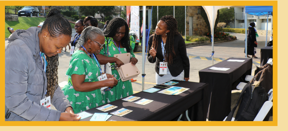
The Knowledge SUCCESS team engages with conference participants at the exhibition booth.